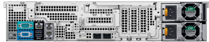
Back (Model shown above with optional LOM SFP+ card)